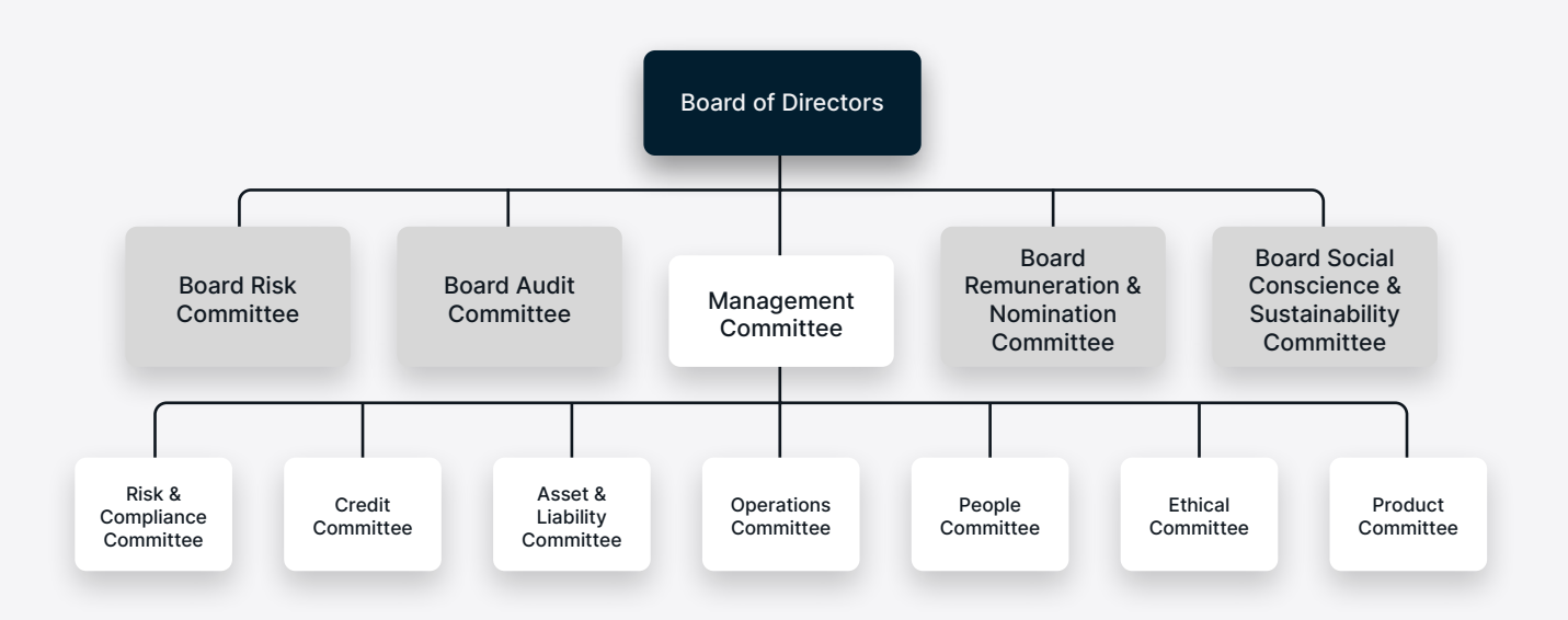
Figure 1 Governance structure

The Board Risk Committee, the Board Audit Committee, the Board Remuneration & Nomination Committee and the Board Social Conscience & Sustainability Committee are all sub-committees of the Board.